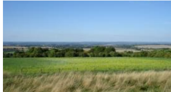
View from Segsbury Camp

Today we start a new chapter in the Letcombe Register. A chance to explore a different way to keep us all in touch.